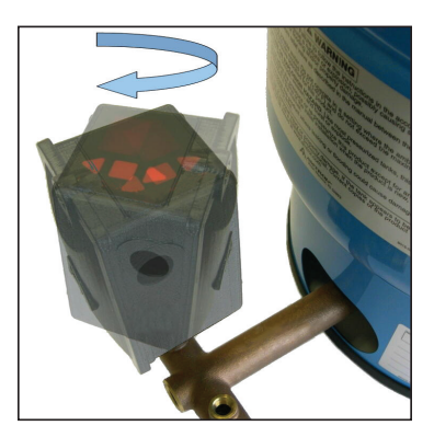
Spins on—no special fittings. LED display rotates 180°.